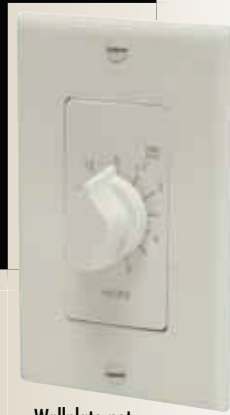
Wallplate not included