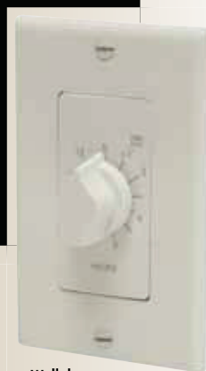
Wallplate not included