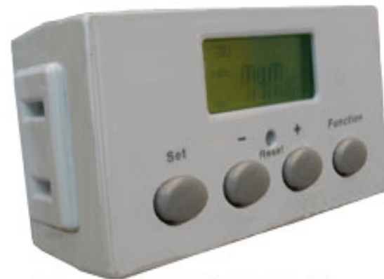
Westek TE22DHB timer

120 VAC, 60 Hz 5 A, Resistivo o Uso General 240 W Tungsteno Bateria de respaldo: Recargable