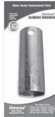
Heavy duty element wrench