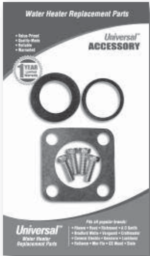
Universal Gasket Kit