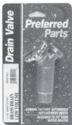
Light Duty Brass Drain Valve: