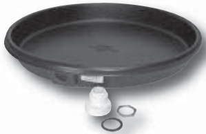
Drain Pan with Fittings: