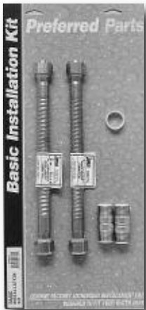
Basic Installation Kit

Non-metallic. Runs from the cold water inlet to deliver cold water to the bottom of the tank as hot water is drawn out.