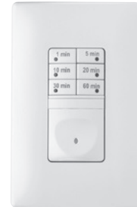
RT1 shown with SWP26