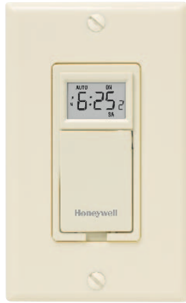
RPLS731B (light almond)