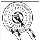
(C) TRIPPERS (B) TIME-OF-DAY MARKER (A) MANUAL KNOB

PROGRAM REPEATS EVERY 24 HOURS TO SET TIMER: (SEE ILLUSTRATION)