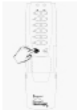
Fig 8c. On the Secondary Controller, Press and Hold the INCLUDE button. Then Release when LEDs flash.