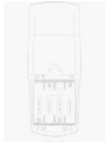
Fig 2b. Battery compartment.