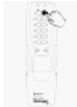
Fig 8d. On the Secondary Controller, Press and release the Channel 1 OFF/DIM button.