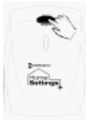
Fig 3c. Press and release the programming button.