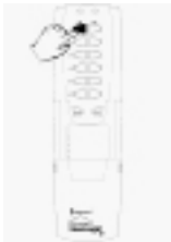
Fig 8b. On the Primary Controller, Press and release the Channel 1 ON/DIM button.