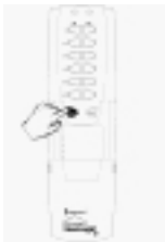
Fig 8a. On the Primary Controller, Press and Hold the INCLUDE button. Then ton.