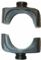
For WH2&WH3 Presses

New & Used Dies are available for all your crimping needs!