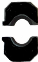
For 052&062 style tools