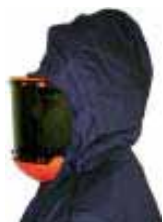
Side View of JSHV1132BL