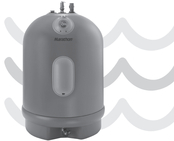
Marathon Point-of-Use 15 and 19.9-U.S. Gallon Capacities Electric

† See Warranty Certificate for complete information