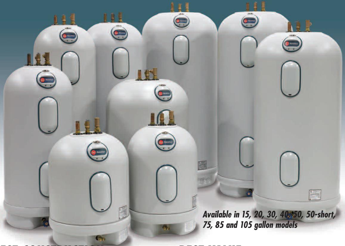
Available in 15, 20, 30, 40, 50, 50-short, 75, 85 and 105 gallon models