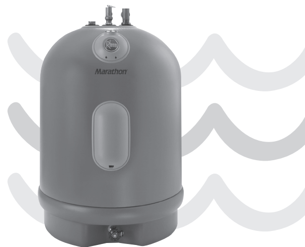
Marathon Point-of-Use 15 and 19.9-U.S. Gallon Capacities Electric

† See Warranty Certificate for complete information