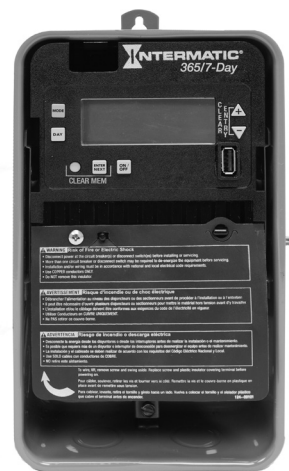
Shown in indoor/outdoor lockable metal enclosure

Follow these instructions to complete the installation and programming of the ET2705 time switch.