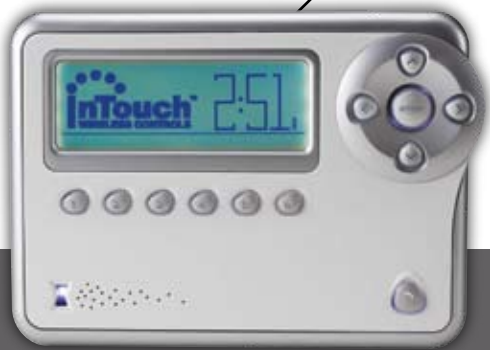
CA7100 Central Command