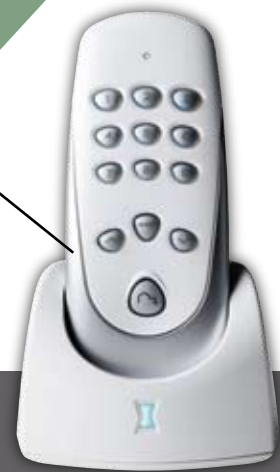
CA5500BR Portable Command