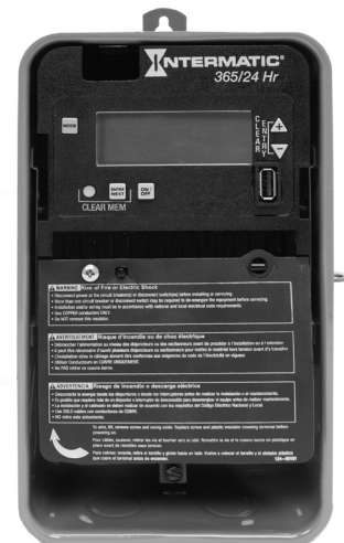
Shown in indoor/outdoor lockable metal enclosure

Follow these instructions to complete the installation and programming of the ET2105 time switch.