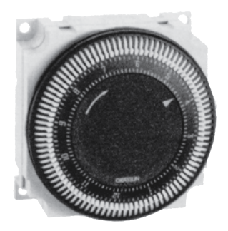
FM/1 S 12H