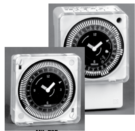
MIL 72E (Flush Mounting)